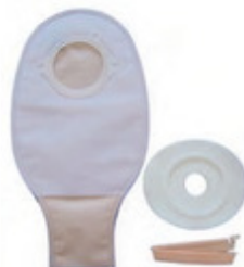
GT030-500 Two-piece Type