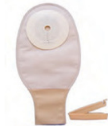
GT030-300 Foam Type