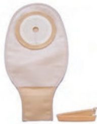
GT030-400 Glue Pan Type