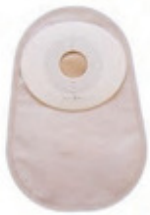
GT030-600 Foam Type