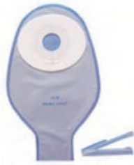
GT030-200 Simple Type