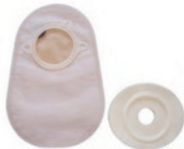
GT030-700 Two-piece Type